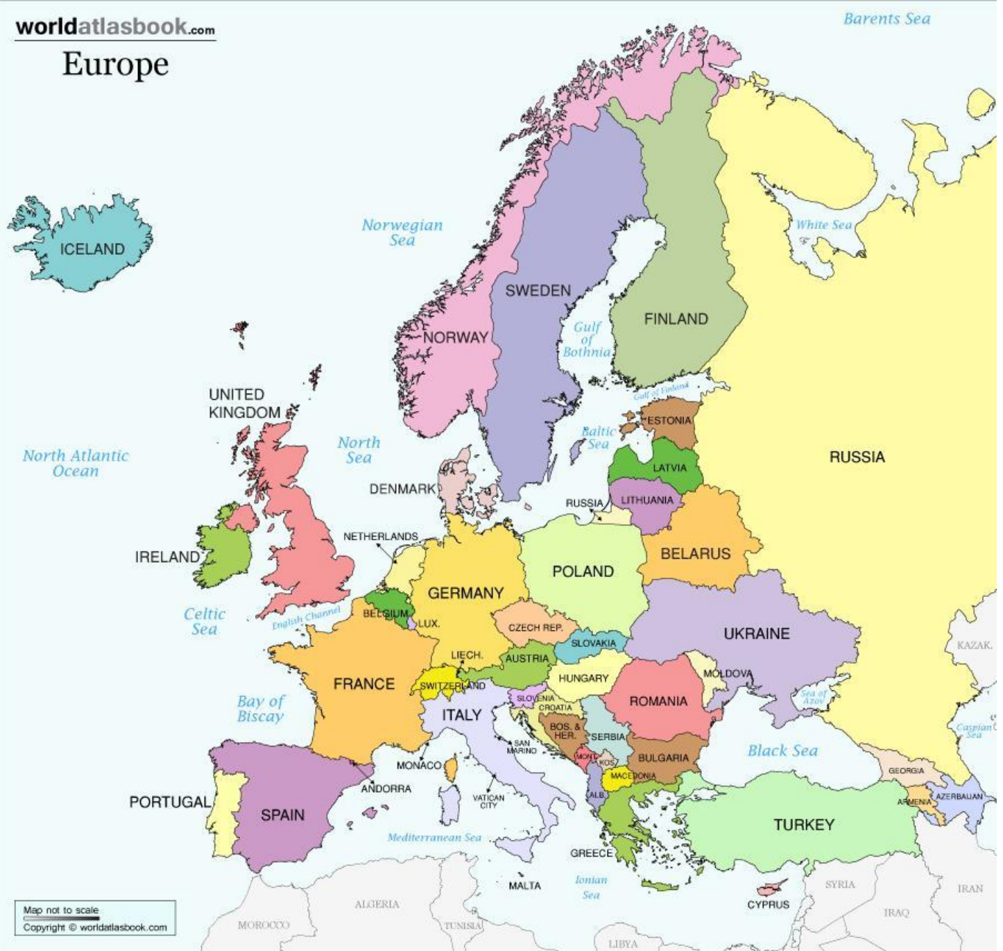
Map #2 Europe (Label all countries in DARK PEN, and color each country a different color/pattern. Create a KEY somewhere on this page.